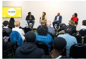
Image of The Heritage Project panel discussion at Heritage Fest 2020