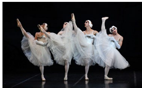
Image of Les Ballets Trockadero de Monte Carlo