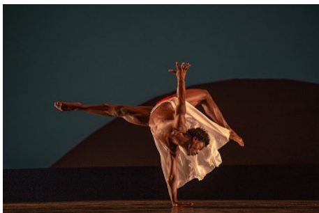
Image of Peter London Global Dance Company