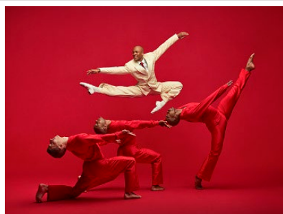
Image of Alvin Ailey's For 'Bird' – With Love