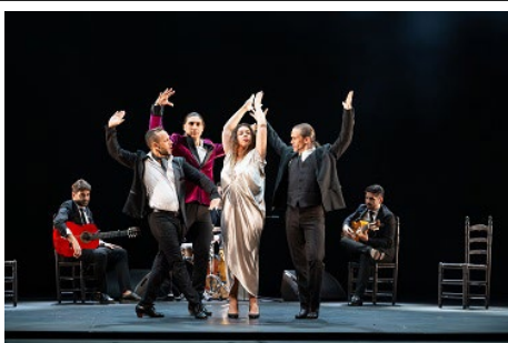
Image of Flamenco Festival XV: Stars of Flamenco