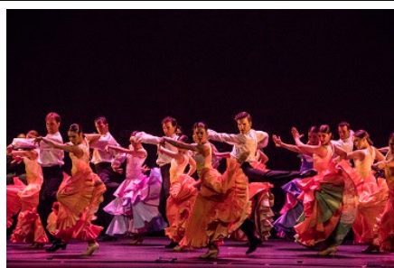
Image of Flamenco Festival XV: Ballet Nacional de España