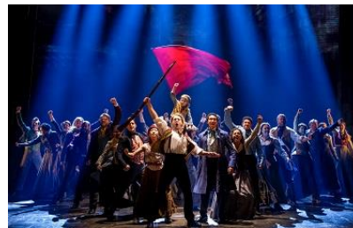
Image of the national touring company of Les Misérables