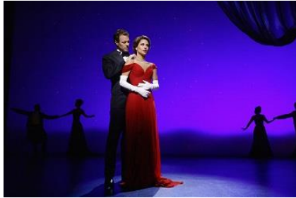
Image of the national touring company of Pretty Woman

Cameron Mackintosh presents the acclaimed production of Boublil and Schönberg's Tony Award®-winning musical phenomenon, LES MISÉRABLES ( @lesmizus ). This brilliant staging has taken the world by storm and has been hailed as “a reborn dream of a production” ( Daily Telegraph ). Set against the backdrop of 19 th century France, LES MISÉRABLES tells an enthralling story of broken dreams and unrequited love, passion, sacrifice and redemption – a timeless testament to the survival of the human spirit. The magnificent score of LES MISÉRABLES includes the songs “I Dreamed a Dream,” “On My Own,” “Bring Him Home,” “One Day More” and many more. For more information visit: US Tour Landing page | Les Misérables | Welcome to the Official Website .