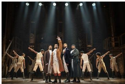
Image of the national touring company of Hamilton