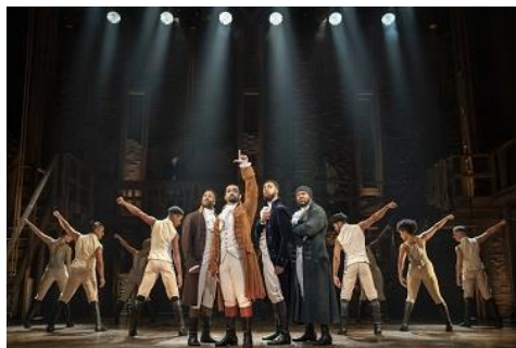
Image of the Company of HAMILTON National Tour

For more information on HAMILTON , please click here .