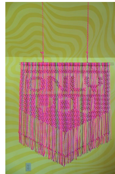
Image of Jessy Nite's "Receptive as a Valley" on display in the Arsht Center's Knight Concert Hall