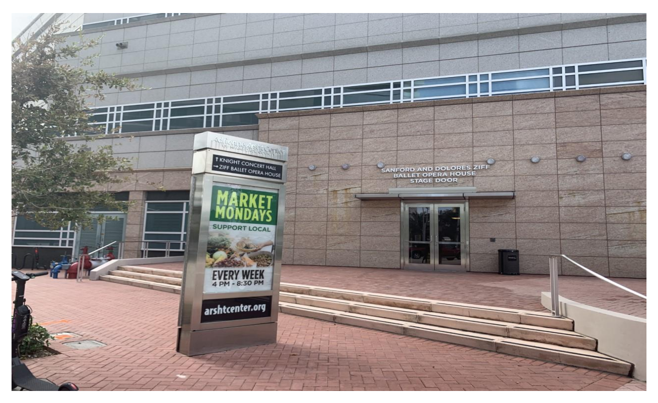
Page 5 of 11

The Stage Door is located at the intersection of Northeast 2<sup>nd</sup> Avenue and Northeast 14<sup>th</sup> Street. For safety and security of guests and staff, anyone working or visiting the Ziff Ballet Opera House Lynn Wolfson Stage, Carnival Studio Theater or Peacock Foundation Studio is required to check in with Security at this entrance, without exception. Those who do not have proper identification and authorization will be denied entry and asked to leave. Once checked in, you will be allowed entry to the dock.