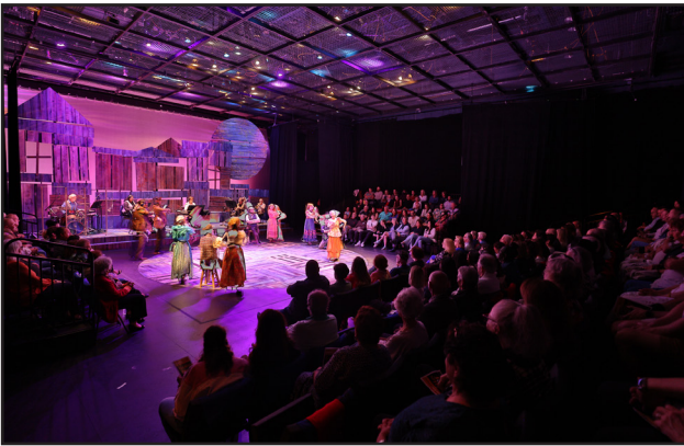
Carnival Studio Theater