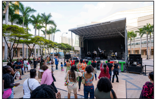
Parker and Vann Thomson Plaza for the Arts

Welcome to the Adrienne Arsht Center, Miami's cultural pulse, curating live-entertainment experiences that spark the imagination and deliver powerful community impact. Set in the heart of downtown Miami, the Arsht is the ideal place not only for performances and televised events, but also parties, meetings and receptions of almost any size.