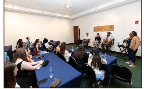
Next Generation Green Room