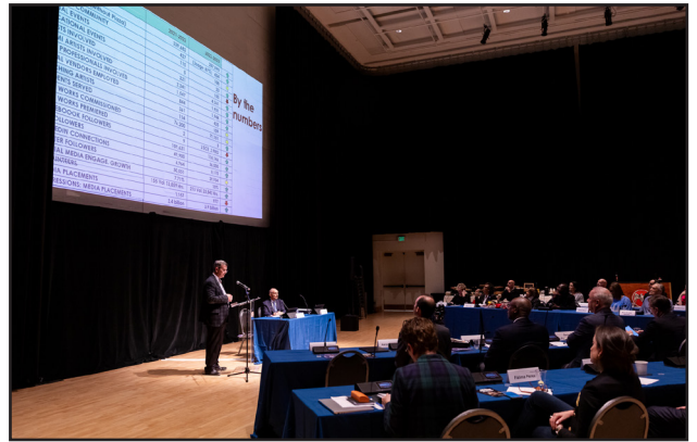
Peacock Foundation Studio