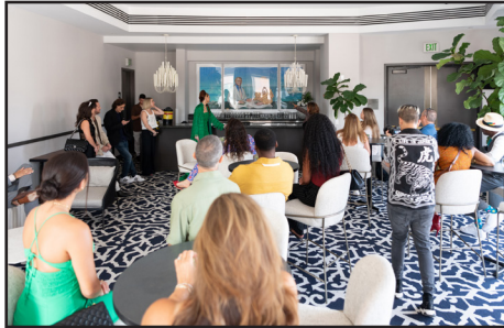
Terra Group Patrons Salon

The Adrienne Arsht Center boasts over 570,000 square feet of usable space! Smaller rooms are available, including: