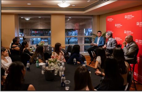
Joyce and M. Anthony Burns Green Room