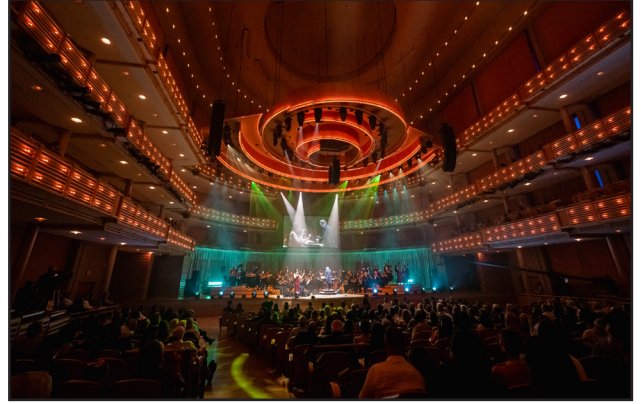
John S. and James L. Knight Concert Hall