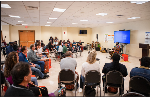
Peacock Education Center