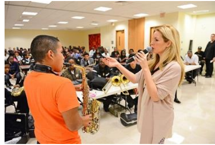
Image of Jazz Roots: Sound Check featuring saxophonist Candy Dulfer

To download high-resolutions versions of the photos above, click here .