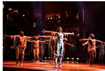
Image of the company of the North American Tour of JESUS CHRIST SUPERSTAR.