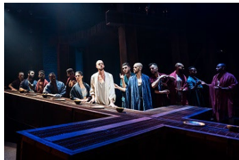
Image of the company of the North American Tour of JESUS CHRIST SUPERSTAR